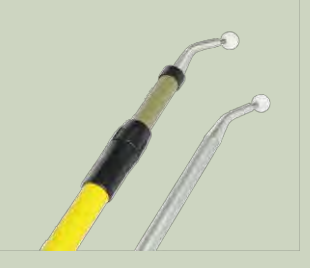
Glazer Pole with Extendable/Standard Handle

After paper taping inside angles, corner roller will crease tape into the angles.